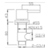
Side Valve Pair