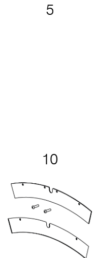
Brackets and screws